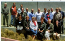
GEONS teachers, engineers, scientists, and E/PO team in front of the Space Sciences Laboratory at a teacher professional development workshop at the University of California in Berkeley, CA in July of 2004.

Geomagnetic Event Observation Network by Students (GEONS) is a national network of schools, each of which has a THEMIS magnetometer located on its campus. The schools with magnetometers were selected by state-wide competition based on the communities' distance from magnetic field contaminations, commitment of the schools to our program, and local infrastructure with the potential for reaching large communities of students and teachers. The teachers at the GEONS magnetometer schools take part in yearly teacher professional development workshops held by the THEMIS Education and Public Outreach (E/PO) team. Teachers across the country are involved in hands-on activities, which support inquiry and use THEMIS data.